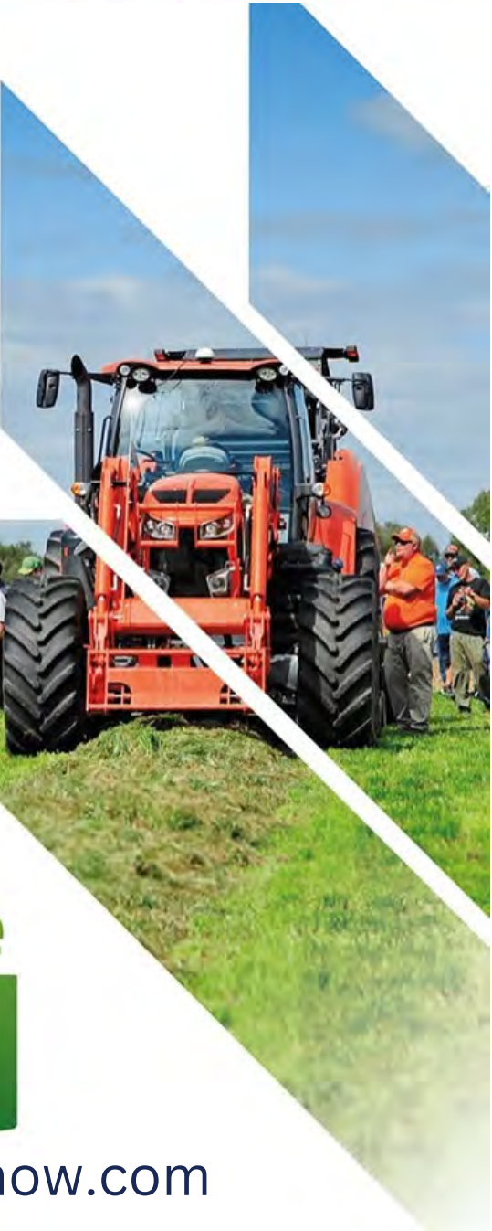
2022 Rural Oxford Economic Development Year in Review